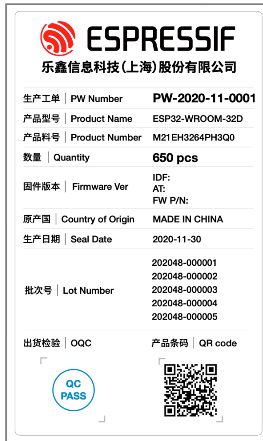
Figure 3: Module Product Label