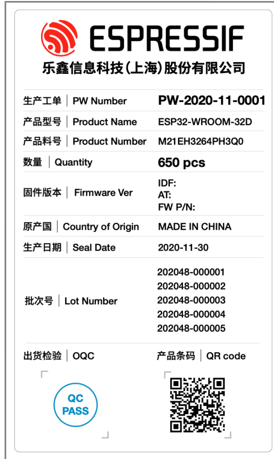
Figure 3: Module Product Label

Modules built around the chip may be identified by PW Number in product label (see Figure 3). For more information, please refer to Espressif Module Packaging Information .